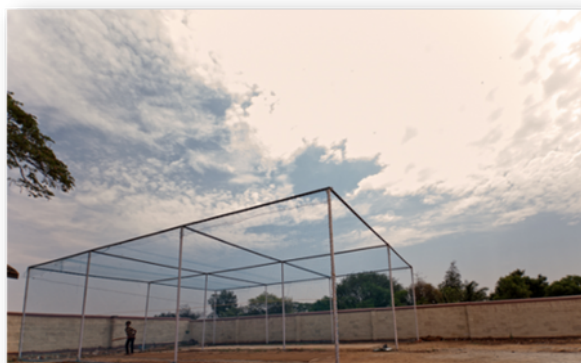
Cricket pitch with nets and a coach