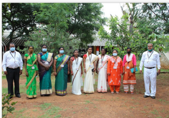
Teachers for primary & high school