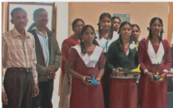
Solar powered reading lamp to each student