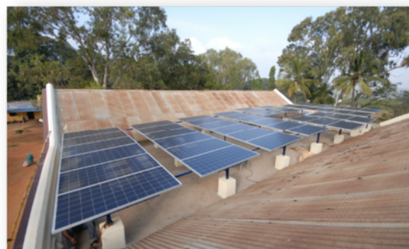
Installation of captive solar power plant