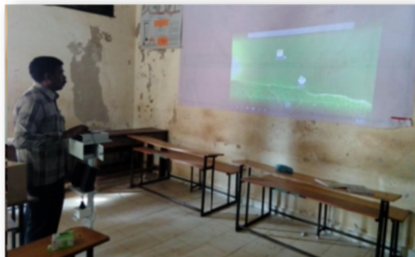
Classrooms re-constructed & 2 Solar powered smart class Installed